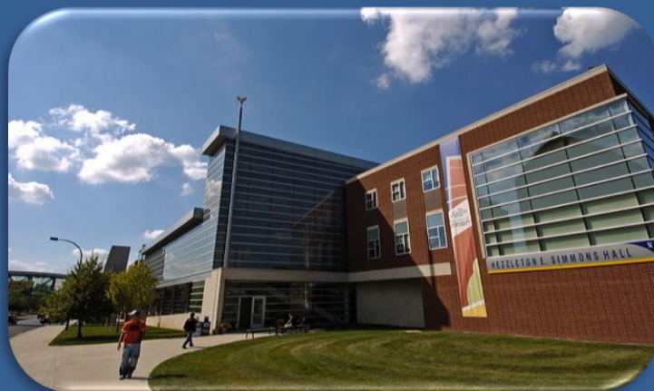
Pictured Above: Simmons Hall

For more information, please visit www.ohiocollegegoalsunday.org