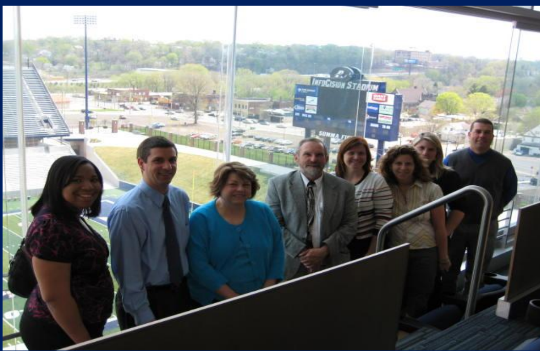
Steering Committee after a tour of InfoCision Stadium